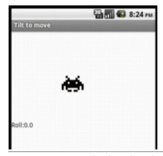
Figure 23-10. A user interface for exploring how you can use roll to move an image

This time, let's try to move an image left or right on the screen based on the user tilting the device, as you might do in a shooting or driving game. Drag out a Canvas and set the Width to "Fill parent" and the Height to 200 pixels. Then, add an ImageSprite or Ball within the Canvas, and add a Label named RollLabel under it to display a property value, as shown in Figure 23-9.