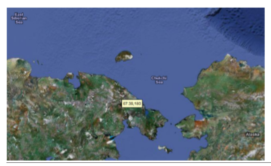
Figure 23-4. A point near the Russian-Alaskan border has longitude 180