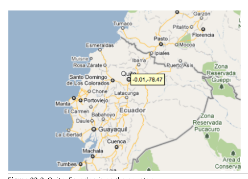
Figure 23-2. Quito, Ecuador, is on the equator

To create a location-aware app, you first need to understand how the global positioning system (GPS) works. GPS data is generated via a series of geosynchronous satellites maintained by the United States government. As long as you have an unobstructed sight line to at least three satellites in the system, your phone can get a reading. A GPS reading consists of your latitude, longitude, and altitude. Latitude is how far north or south you are relative to the equator, with values for north being positive and south being negative. The range is -90 to 90. Figure 23-1 shows a Google map of a spot near Quito, Ecuador. The latitude shown on the map is -0.01, just barely south of the equator!