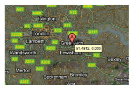
Figure 23-3. The Royal Observatory in Greenwich shoots a beam of light along the Prime Meridian

Longitude values range from –180 to 180. Figure 23-3 shows a spot in Russia, very close to Alaska, that has a 180.0 longitude. You might say that a location like this is halfway around the world from Greenwich (0.0 longitude).